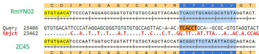
FIGURE 2 Alignment of nucleotide and amino acid sequences of the S protein from bat-SL-CoVZC45 (MG772933.1) and RmYN02 at the S1/S2 junction site. No insertions of nucleotides possibly evolving in a furin cleavage site can be observed (in blue)

spike protein of SARS-CoV-2 of a cleavage site activated by a host-cell enzyme furin, previously not identified in other beta-CoVs of lineage b [36] and similar to that of Middle East respiratory syndrome (MERS) coronavirus. [35] Host protease processing plays a pivotal role as a species and tissue barrier and engineering of the cleavage sites of CoV spike proteins modifies virus tropism and virulence. [37] The ubiquitous expression of furin in different organs and tissues have conferred to SARS-CoV-2 the ability to infect organs usually invulnerable to other CoVs, leading to systemic infection in the body. [38] Cell-cultured SARS-CoV-2 that was missing the above-mentioned cleavage site caused attenuated symptoms in infected hamsters, [39] and mutagenesis studies have confirmed that the polybasic furin site is essential for SARS-CoV-2's ability to infect human lung cells. [40]